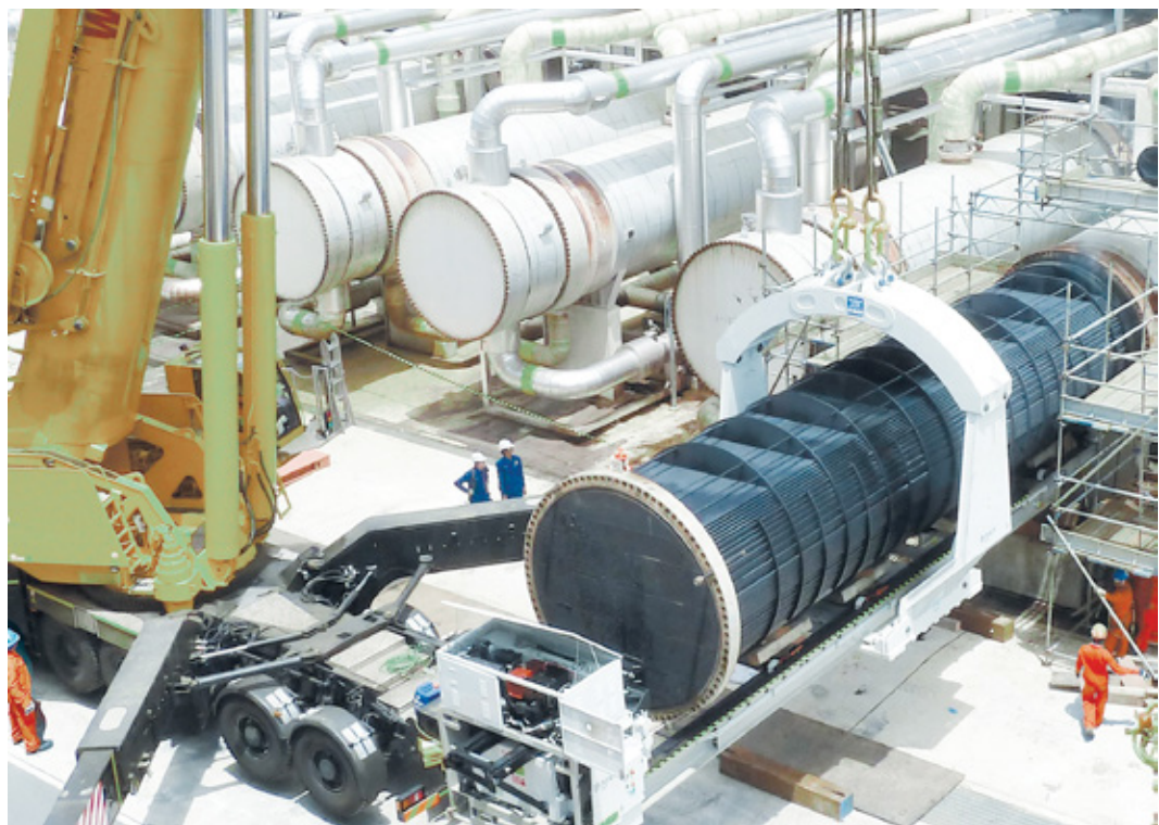
Fig. 3 – MEF express: aerial tube bundle puller

During the extraction and transport operations it is essential that the tube bundle is not damaged or deformed. Maus Italia technical office has years of experience and invests thousands of hours in research and development to study customized solutions for every situation, geometry, size, area and position.