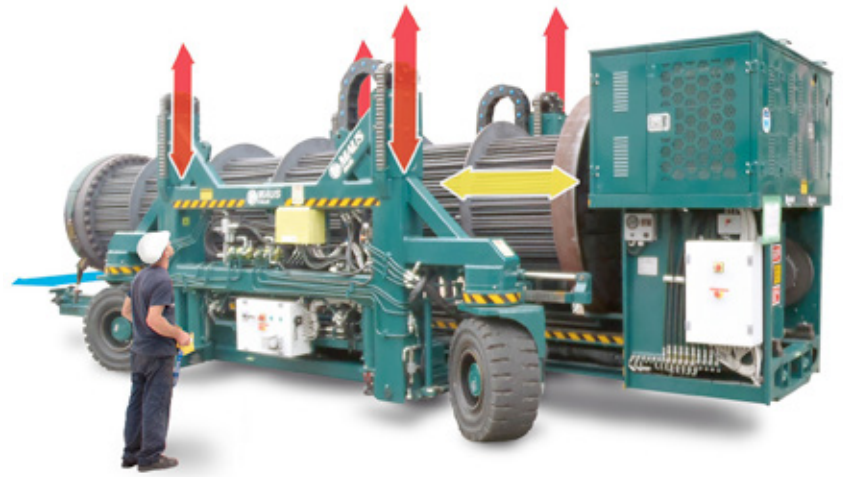
Fig. 4 – MEF mobil

MEF Truck, thanks to the original project of the