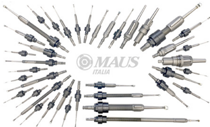
Fig. 1 – Tube expander for shell and heat exchanger

The influence of maintenance costs on production costs can reach values higher than 30%, not to mention the costs incurred, which may duplicate the maintenance costs in critical production systems whose inadequate maintenance may put the operation safety at risk. The solutions proposed by Maus Italia allow not only to perform maintenance more effectively but also to transform it into an effective process that can contribute to the ultimate goal of business success. Overcoming a traditional approach to maintenance conceived as a limited action at operational level with a short-term perspective is necessary to implement this kind of change, so that it can take on a tactical-strategic role with a broad, medium-to-long term vision. This way of performing maintenance aims to transform it from a cost unit to a unit capable of producing results